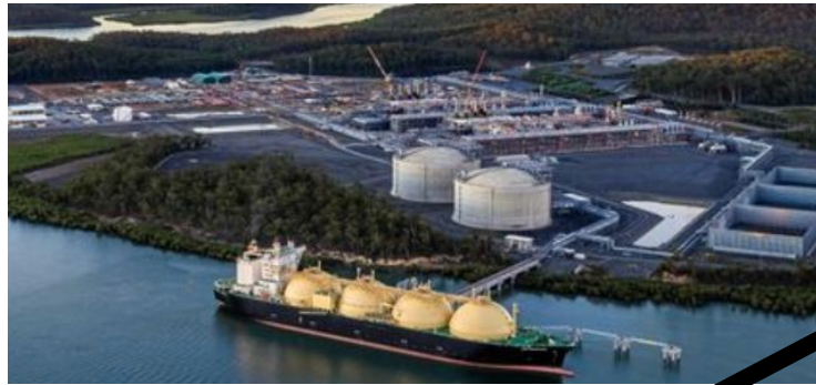
Curtis Is. Liquefaction plant Bundaberg QLD

Energy Minister points finger to LNG for wholesale electricity price hikes